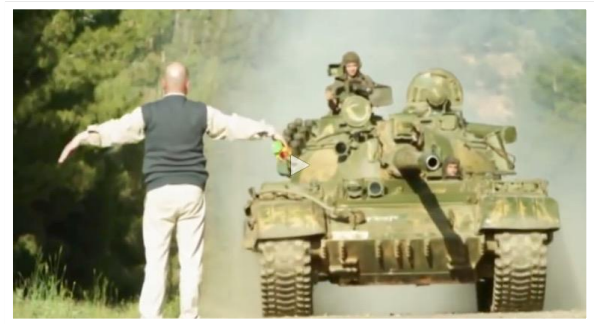
4 O'clock Paradise Time